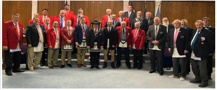
January 2022 Stated Communication— "Red Coat Night"